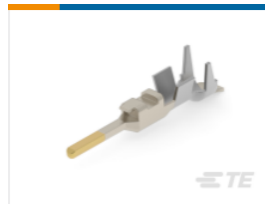
TE Part # 1-2834068-3 PIN CONTACT, MINIATURE WATERPROOF CONN