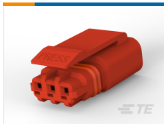
TE Part # 3-2834074-3 3P PLUG, MINIATURE WATERPROOF CONN,RED