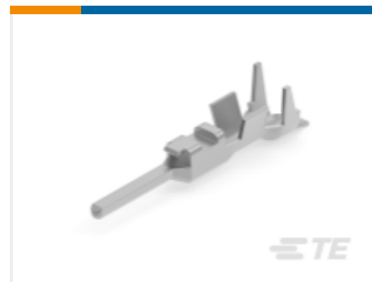
TE Part # 1-2834068-2 PIN CONTACT, MINIATURE WATERPROOF CONN